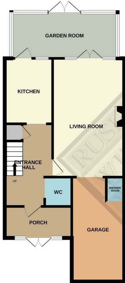
GROUND FLOOR 661 sq.ft. (61.4 sq.m.) approx.